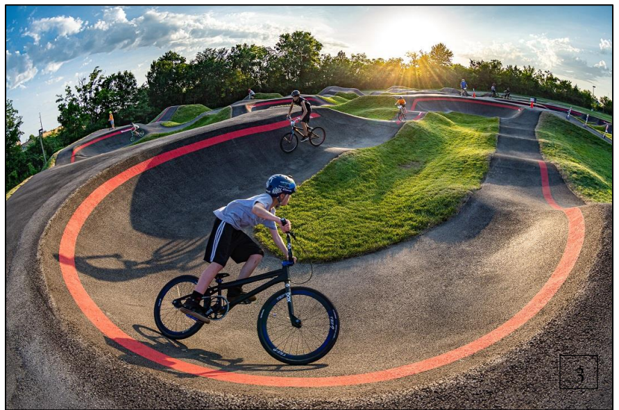
Example design (1) provided by Velosolutions and pictures (2,3) of built tracks in use.