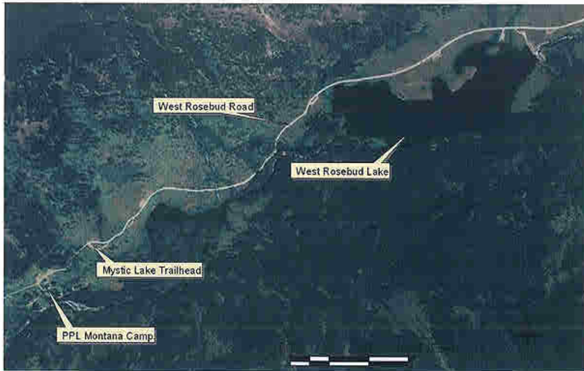
Figure 2. Recreation and public access - West Rosebud Lake and vicinity - 2007

The Mystic Lake Trailhead is located near the end of West Rosebud Road. The trailhead provides parking for visitors hiking to Mystic Lake and the Absaroka-Beartooth Wilderness. The Mystic Lake Trail passes through the PPL Montana Camp near the trailhead.