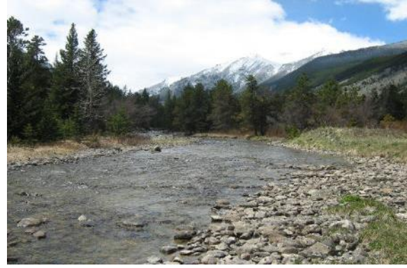
Photo 2: May 25, 2010 harlequin duck survey site conditions 2011 Survey

A survey was completed on May 16, 2011. The field survey crew included Erik Nyquist, Pat Eller, and Brian Wainright with MMI. Site conditions were approximately 55 °F, southwest winds at 5 to 10 mph, and approximately 20 percent cloud cover. No precipitation had occurred within the 24 hours prior to the survey. No harlequin ducks were observed from the USFS boundary upstream to the powerhouse.